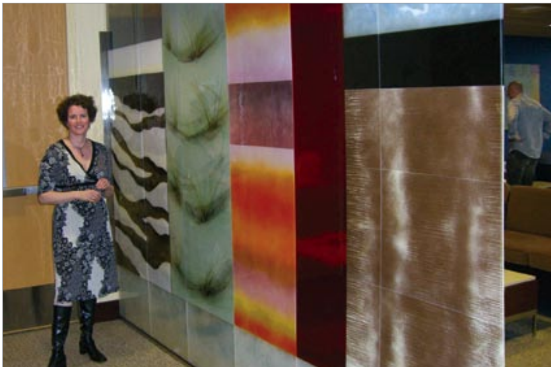
Untitled (clinic side)