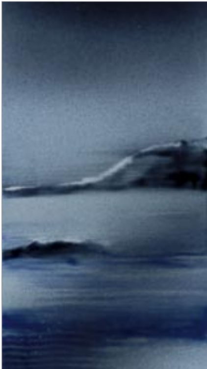
From the Ferry